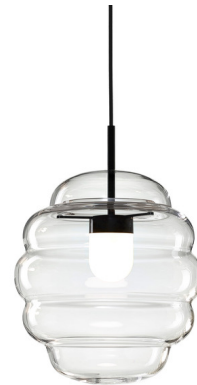
Shown in black / clear