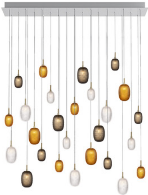
Shown in: White / Brushed Gold / Multicolor

The Metamorphosis Linear Pendant was created by transforming crystal into a stunning lighted jewel. It is a display of both craftsmanship and technical execution. It features a collection of delicate geometric cuts of hand-blown crystal. Includes a combination of small and large pendants in Amber,, Clear and Cigar with a White canopy and Brushed Gold accents. Includes canopy, power supply and 98.4 inch cord lengths. Cords can be pre-cut to varying lengths (see attached manufacturer installation instructions for more information). TRIAC or 0-10V dimming.