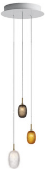
Shown in: White / Brushed Gold / Multicolor

The Metamorphosis Multi Light Pendant was created by transforming crystal into a stunning lighted jewel. It is a display of both craftsmanship and technical execution. It features a collection of delicate geometric cuts of hand-blown crystal. Includes a combination of small and large pendants in Amber, Clear and Cigar with a White canopy and Brushed Gold accents. Includes canopy, power supply and 98.4 inch cord lengths. Cords can be pre-cut to varying lengths (see attached manufacturer installation instructions for more information). TRIAC or 0-10V dimming.