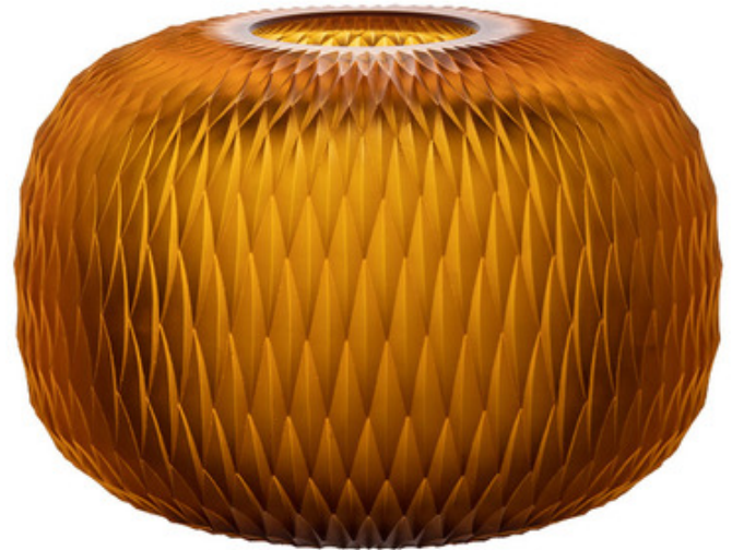
Shown in: Amber

The Metamorphosis Small Vase was created by transforming crystal into a stunning jewel. It is a display of both craftsmanship and technical execution. It features a delicate geometric cut of hand-blown crystal.