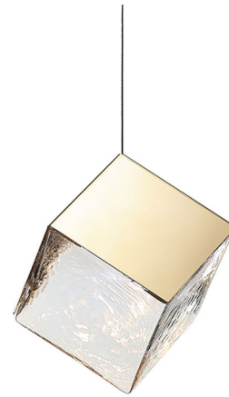
Shown in gold / clear

COLOR RENDERING . . . . . 90 CRI LAMP COLOR . . . . . 2700K LUMENS/WATT . . . . . 100.00 LUMINOUS FLUX . . . . . 120 lumens