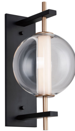
Shown in black / gold / clear

LAMP LIFE . . . . . 25000 hours COLOR RENDERING . . . . . 90 CRI LAMP COLOR . . . . . 3000K LUMENS/WATT . . . . . 72.00 LUMINOUS FLUX . . . . . 720 lumens