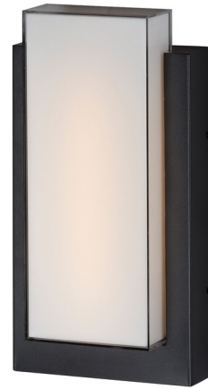
Shown in black / white