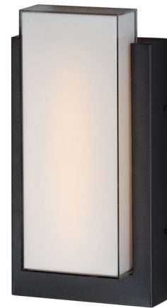
Shown in black / white

LAMP LIFE . . . . . 35000 hours COLOR RENDERING . . . . . 90 CRI LAMP COLOR . . . . . 3000K LUMENS/WATT . . . . . 78.00 LUMINOUS FLUX . . . . . 1170 lumens