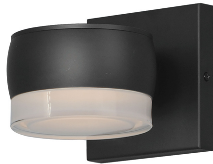
Shown in black / clear / white