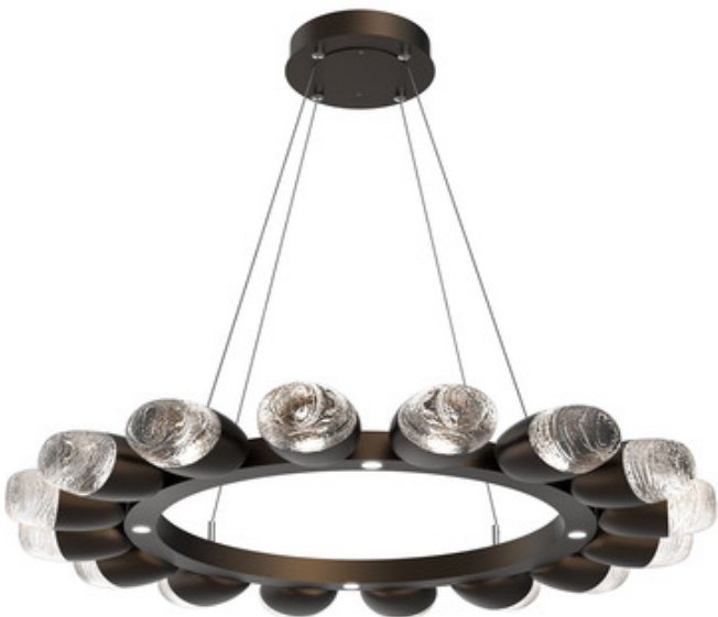
Shown in: Flat Bronze / Clear Cast Glass

The Pebble Chandelier draws its inspiration from both nature and jewelry, featuring multiple pebble shaped diffusers arranged in a ring. Contrasting with the sleek metalwork, each pebble is capped with a textured glass diffuser reminiscent of a rondelle-cut bead. Each diffuser may be rotated to a horizontal or vertical position for added versatility. Note: Requires junction box for fixtures over 50 pounds.