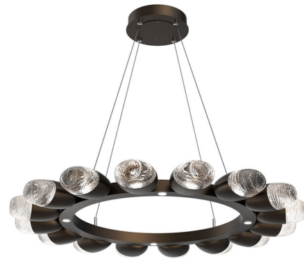
Shown in flat bronze / clear cast glass