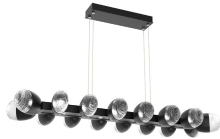
Shown in matte black / clear cast glass

Inspired by nature and jewelry, the Pebble Linear Pendant pays homage to both classic and contemporary design. Sleek metalwork provides a perfect contrast to the rondelle-shaped diffusers of textured cast glass. Each diffuser may be rotated to a horizontal or vertical position for added versatility. Driver included in canopy. Note: Requires junction box for fixtures weighing over 50 pounds.