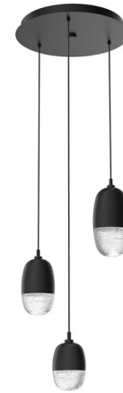
Shown in matte black / clear cast glass

COLOR RENDERING . . . . . 90 CRI LAMP COLOR . . . . . 2700K LUMENS/WATT . . . . . 236.59 LUMINOUS FLUX . . . . . 1261 lumens