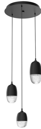
Shown in matte black / clear cast glass

COLOR RENDERING . . . . . 90 CRI LAMP COLOR . . . . . 2700K LUMENS/WATT . . . . . 236.59 LUMINOUS FLUX . . . . . 1261 lumens