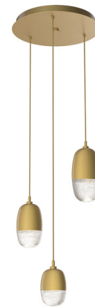
Shown in gilded brass / clear cast glass

PRODUCT DIMENSIONS . . . . . Min-Max Overall Height: 15.7" - 132" COLOR RENDERING . . . . . 90 CRI LAMP COLOR . . . . . 2700K LUMENS/WATT . . . . . 236.59 LUMINOUS FLUX . . . . . 1261 lumens