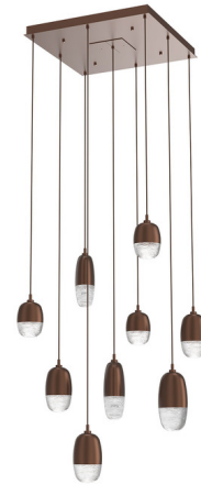
Shown in burnished bronze / clear cast glass

PRODUCT DIMENSIONS . . . . . Min-Max Overall Height: 15.7" - 132" COLOR RENDERING . . . . . 90 CRI LAMP COLOR . . . . . 2700K LUMENS/WATT . . . . . 720.38 LUMINOUS FLUX . . . . . 3782 lumens