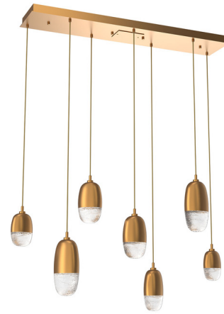
Shown in novel brass / clear cast glass

PRODUCT DIMENSIONS . . . . . Min-Max Overall Height: 15.7" - 132" COLOR RENDERING . . . . . 90 CRI LAMP COLOR . . . . . 2700K LUMENS/WATT . . . . . 565.77 LUMINOUS FLUX . . . . . 2942 lumens