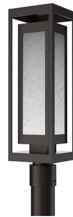
Shown in statuary bronze / frosted seeded

COLOR RENDERING . . . . . 90 CRI LAMP COLOR . . . . . 3000K LUMENS/WATT . . . . . 88.89 LUMINOUS FLUX . . . . . 400 lumens