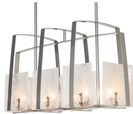
Shown in sterling / white swirl

The Arc Linear Pendant brings a contemporary update to the traditional lantern style. Thick, hand poured White Swirl slightly convex glass panels are framed with sweeping arcs of steel. Canopy: 27 inch x 5 inch rectangle. Sloped ceiling adaptable to 45 degrees. Double down-rod fixtures can be used in one direction only. The two down-rods must remain the same length. The fixtures will run parallel or along the slope, but not perpendicular or up the slope. Lifetime Limited Warranty when installed in residential setting. Handcrafted to order by skilled artisans in Vermont, USA. Note: Due to the weight of this fixture, additional ceiling support is required.