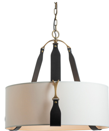
Shown in antique brass / natural anna

PRODUCT DIMENSIONS . . . . . Adjustable Chain Length: 36"