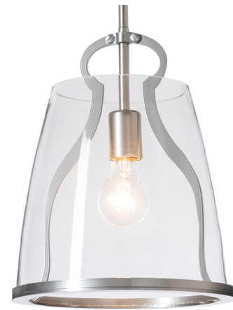
Shown in sterling / clear

PRODUCT DIMENSIONS . . . . . Downrods: One 3", One 6" and Two 12" Included