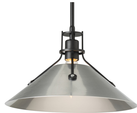
Shown in black / sterling

PRODUCT DIMENSIONS . . . . . Downrods: One 3", One 6" and Three 12" Included