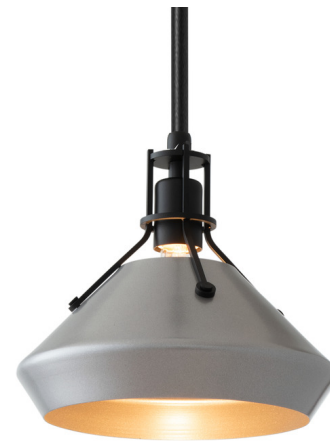
Shown in black / vintage platinum

PRODUCT DIMENSIONS . . . . . Downrods: One 3", One 6" and Three 12" included