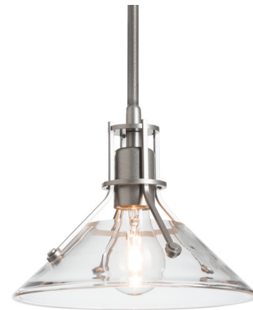
Shown in vintage platinum / clear

PRODUCT DIMENSIONS . . . . . Downrods: One 3", One 6" and Three 12" Included