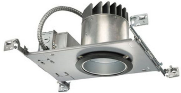
Shown in: Aluminum

6 Inch 120 Volt 600 Lumen LED IC New Construction Housing is a dedicated LED, Air-Loc sealed new construction housing with integral light engine. Shallow housing allows for fit in 2 x 6 construction. IC designation allows housing to be completely covered with insulation. Fully sealed housing stops infiltration and exfiltration of air reducing heating and air cooling costs without the use of additional gaskets. Replaceable light engine mounts directly to housing and incorporates the latest generation high lumen output LED array. Comparable light output to a 65 watt BR30 incandescent while consuming less than 12 watts. Available with 3500K color temperature, 90 minimum CRI. Wide flood distribution shipped as standard with optional optic accessories available and sold separately. 120 volt only driver is dimmable with the use of most incandescent, magnetic low voltage and electronic low voltage wall box dimmers (see attached manufacturer dimmer compatibility reference). Life rated for 50,000 hours at 70 percent lumen maintenance. Energy Star qualified and Title 24 compliant with specific trims. UL listed for damp locations. 15.75 inch length x 9.1 inch width x 5.1 inch height. A complete fixture includes a housing and trim, sold separately.