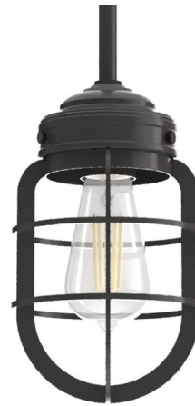
Shown in noble bronze

Featuring a classic bulb cage design, the Starklake Pendant evokes farmhouse, industrial, or coastal styles and brings distinct character to your space. Hang a single light over a small table or suspend multiple to illuminate a larger space.