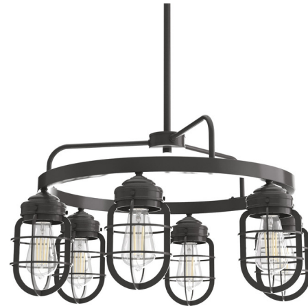
Shown in noble bronze

The Starklake Chandelier is a cluster of bulb cages influenced by rustic design. Evoking industrial, farmhouse or coastal styles, they bring distinct character to your space.