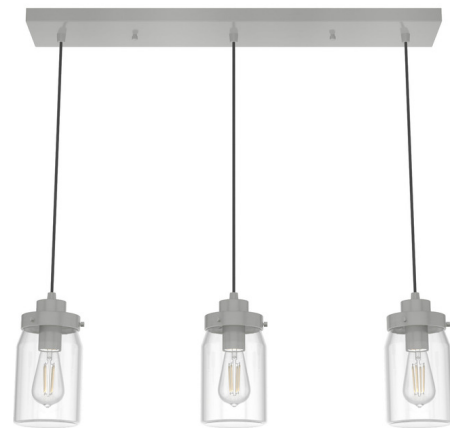
Shown in brushed nickel / clear

COLOR . . . . . Clear BODY FINISH . . . . . Brushed Nickel WATTAGE . . . . . 180W DIMMER . . . . . Standard 120V DIMENSIONS . . . . . 28.5"W x 8.75"H BULB NOT INCLUDED 3 x Edison ST-Shape/Medium (E26)/60W/120V Incandescent OTHER BULB OPTIONS . . . . . 3 x Edison ST-Shape/Medium (E26)/120V LED