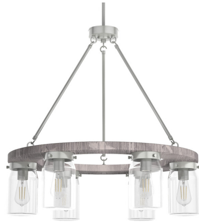
Shown in brushed nickel / clear

The Devon Park Chandelier offers charming farmhouse style with its wood finished ring and mason jar inspired glass shades. Place it in a kitchen, dining area or entryway to create warm, welcoming space. The 26.5 inch chandelier is UL listed, and the 31 inch is ETL listed.