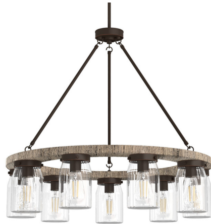
Shown in onyx bengal / clear

The Devon Park Chandelier offers charming farmhouse style with its wood finished ring and mason jar inspired glass shades. Place it in a kitchen, dining area or entryway to create warm, welcoming space. The 26.5 inch chandelier is UL listed, and the 31 inch is ETL listed.