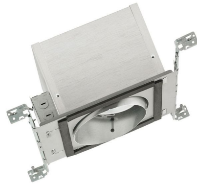
Shown in aluminum