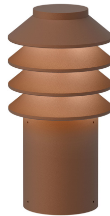
Shown in corten