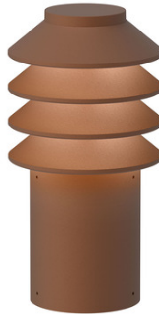
Shown in: Corten

The Bysted Outdoor Bollard features a symmetrical design with four rings to softly reflect light downwards. The underside of each ring is painted white for optimal reflection. Mounting options include: Spike Mount for use in soil or gravel. Spike mount bollards come pre-wired with a weatherproof 12 inch connector cable for above-ground use. Anchor Mounts are designed for use in new concrete pads and require professional below-ground cabling. Baseplate Mounts include a baseplate for securing the bollard to existing concrete or decks and are designed for use with professional below-ground cabling. Anchor and Baseplate fixtures include inputs for professional cabling. Note: All mounting options require an external 24V DC power supply (sold separately). 4000K lamp is not available with Corten finish.