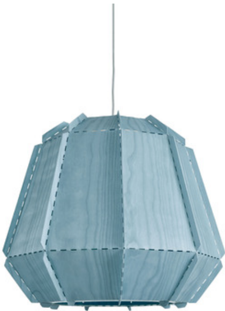
Shown in: Chrome / Sea Blue Wood

The Stitches Bamako Pendant, designed by Egbert-Jan Lam of Netherlands based Burojet Design Studio, is named after a place in Mali, West Africa, known for its long history as a producer of embroidery. Veneer lengths are crafted in a traditional sewing fashion - by marking out a pattern, cutting it and then repeating, so producing an individual lamp. Light shines through the visible hemstitching, cleverly simulating the embellished stitches found on cloth. It hints at the simple beauty found in Malain embroidery.