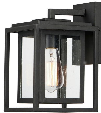
Shown in black / clear seeded

The Cabana Outdoor Wall Sconce features a dual framed structure that creates dimension and is both contemporary and transitional. The construction consists of two frames of square tubing and squared components. The inner frame's Clear Seedy glass reduces glare from the light and appears dirt-free for longer periods.