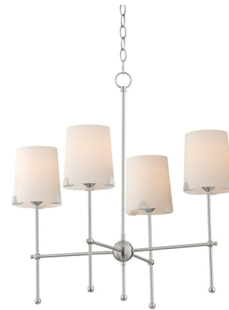
Shown in satin nickel / white

The Huntington Chandelier features Satin White taper shades in a classic shape and rest on elegantly thin frames. They are supported secured by a mostly concealed structure with coordinating semicircular tabs that complement the spherical joints of the frame. The modern design details and updated shade materials refresh the outlook of a timeless chandelier though its use of thoughtful features. Note: Satin Brass is only available in 34 inch size.