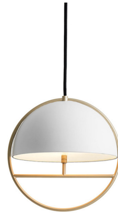
Shown in champagne gold / white