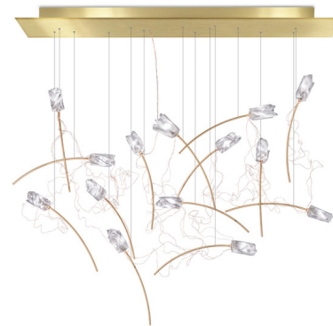
Shown in brass / transparent

PRODUCT DIMENSIONS . . . . . Canopy: 43"L x 9.75"W LAMP COLOR . . . . . 2900K LUMENS/WATT . . . . . 1,400.00 LUMINOUS FLUX . . . . . 7000 lumens