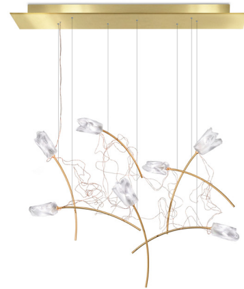
Shown in brass / transparent

PRODUCT DIMENSIONS . . . . . Canopy: 27.25"L x 9.75"W LAMP COLOR . . . . . 2900K LUMENS/WATT . . . . . 700.00 LUMINOUS FLUX . . . . . 3500 lumens