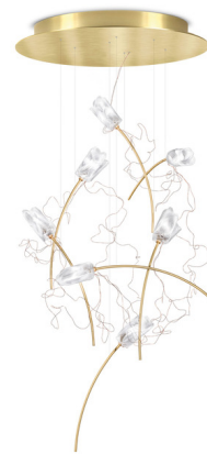
Shown in brass / transparent