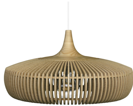
Shown in white / light oak

The Clava Dine Wood Pendant will stand out as a sculptural piece in any space, featuring a round shade constructed of narrow wooden slats. Each slat is constructed from laser cut ash and oak veneer and is precisely arranged around the piece with expert craftsmanship. A tapered solid oak top caps the shade to complete the look. Available with a black or white cord and round canopy.