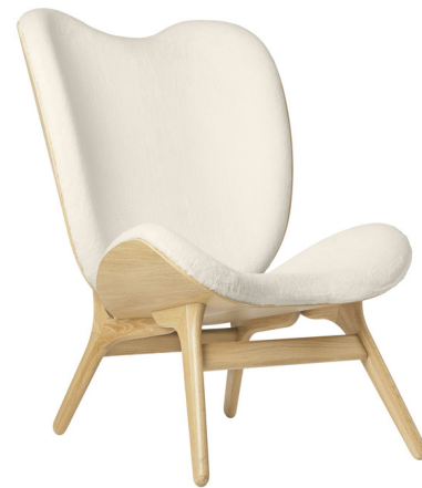
Shown in light oak / teddy white

The Conversation Piece Lounge Chair is a low seat that encourages relaxation and conversation with friends. The delicate design features organic curves with no exposed fittings and an enveloping shape that allows for long periods of comfortable sitting. Solid oak legs and a molded plywood seat and back give the piece a distinctly Scandinavian expression. Available with Horizons 100% recycled polyester fabric or Teddy white 100% polyester fleece.