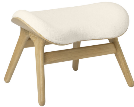
Shown in light oak / teddy white

The Conversation Piece Ottoman is designed to complement the Conversation Piece lounge chair. The delicate design features organic curves with no exposed fittings. Solid oak legs and a molded plywood seat give the piece a distinctly Scandinavian expression. Available with Horizons 100% recycled polyester fabric or Teddy white 100% polyester fleece.