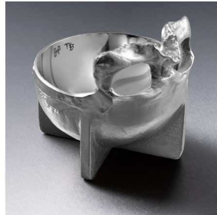
Shown in steel

Designed by Travis Barker, the Skull Bowl is created with Solid Cast Metal in a Steel or Brass finish. It is polished and refined by hand and debossed with B+P & TB insignias. No two pieces are the same. Ships with a black silk bag and gift box.