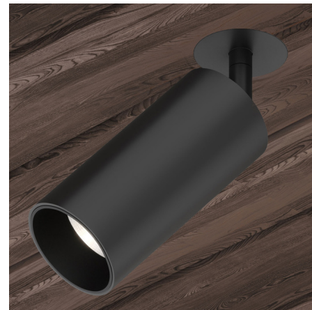
Shown in black

LAMP LIFE . . . . . 60000 hours BEAM ANGLE . . . . . 10° COLOR RENDERING . . . . . 92 CRI LAMP COLOR . . . . . 2700K LUMENS/WATT . . . . . 65.71 LUMINOUS FLUX . . . . . 920 lumens