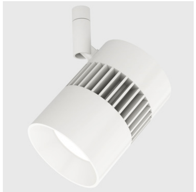
Shown in: White

The Vanishing Point Radiant Large integrates with the Vanishing Point Plaster-In-System for use in drywall applications. Features a .5 inch opening with no visible canopy line -- just the small .5 inch point of connection where the fixture stem disappears into the ceiling. Radiant heat sink swivels 90 degrees vertically and 360 degrees horizontally. Available in a variety of color temperature options, including Warm Dim (3000K-1800K), offered in multiple beam spread options that can be changed in the field: 2400K, 2700K, 3000K and 3500K available in Narrow Spot (10 degree), Spot (20 degree), Narrow Flood (35 degree), Flood (45 degree), and Wide Flood (60 degree) beam angle options. Warm Dim available in Narrow Spot (15 degree), Spot (25 degree), Narrow Flood (35 degree), Flood (45 degree), and Wide Flood (60 degree). You may feed up to to 7 Radiant large fixtures with a single 24VDC remote Universal power supply (power supply required and sold separately). Universal power supply dimmable with ELV/TRIAC/0-10V. Note: Required remote power supply sold separately.