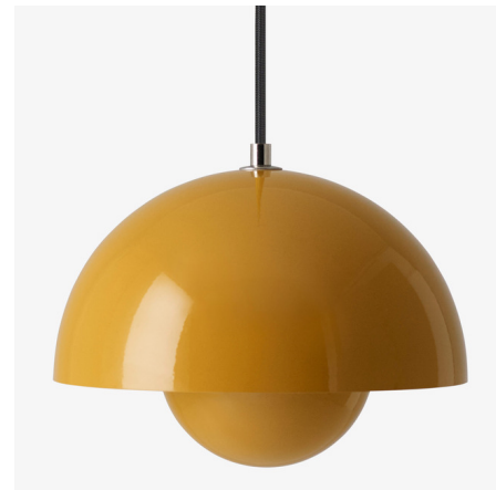
Shown in mustard / mustard

The Flowerpot VP1 Pendant features a fascinating design that exudes modern simplicity while celebrating vintage style. Two hemispheres crafted out of deep drawn metal face each other to create a stylish profile. Hang a single Flowerpot over a side table, or suspend a dazzling cluster to illuminate a living room. This pendant is available with or without a UL listing. Cord color varies depending on the finish and whether or not the item is UL listed. To see cord color, select the desired finish and option (non-UL or UL), then see the cord information under Product Details. Pendants with a black cord are supplied with a black Canopy. Pendants with white or any other colored cords are supplied with a white canopy.