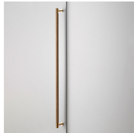
Shown in brass

PRODUCT DIMENSIONS . . . . . Center to Center: 28.5"