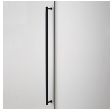
Shown in black

PRODUCT DIMENSIONS . . . . . Center to Center: 28.5"