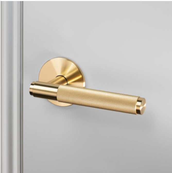
Shown in: Brass

The Cross Door Handle Set features a diamond-cut, cross-knurl detailing. Intended for interior doors. Includes two handles and a 2-3/8 inch backset US passage tubular latch with through bolt fixings. Available with or without a privacy lock. Black: Made from Aluminum and then anodized to give a deep Black finish. Brass: Made from precision-machined solid brass and finished with two layers of durable satin lacquer. This finish will age slowly, moving from radiant brass to deeper and golden within a few years. Smoked Bronze: This is a living finish, meaning the more it is used the more the base Brass will show through. It will age with you. Steel: Made from solid stainless steel and refined by hand. Steel is Buster + Punch's most durable finish and will remain the same for years to come.