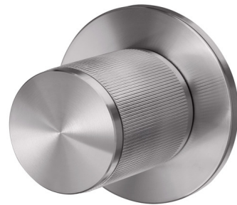
Shown in steel

The Linear Pattern Pre-Drilled Passage Door Knob Set is refined by hand and features a linear knurl pattern. Intended for interior doors. Includes two knobs and an 8mm square spindle. Fits doors with a minimum of 1.375 inch thickness. Tubular latch sold separately. Black: Made from Aluminum and then anodized to give a deep Black finish. Brass: Made from precision-machined solid brass and finished with two layers of durable satin lacquer. This finish will age slowly, moving from radiant brass to deeper and golden within a few years. Smoked Bronze: This is a living finish, meaning the more it is used the more the base Brass will show through. It will age with you. Steel: Made from solid stainless steel and refined by hand. Steel is Buster + Punch's most durable finish and will remain the same for years to come.