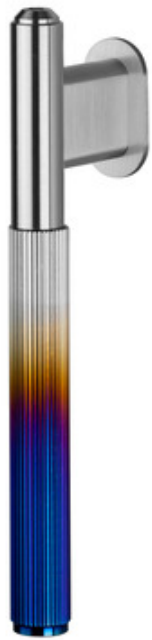
Shown in: Burnt Steel

Buster + Punch's L Bar is refined by hand and features their signature diamond-cut, linear knurl pattern. Black: Made from Aluminum and then anodized to give a deep Black finish. Brass: Made from precision-machined solid brass and finished with two layers of durable satin lacquer. This finish will age slowly, moving from radiant brass to deeper and golden within a few years. Steel: Made from solid stainless steel and refined by hand. Steel is Buster + Punch's most durable finish and will remain the same for years to come. Burnt Steel: Made from solid Stainless Steel and exposed to excessive heat to create a unique rainbow of blue, purple, and yellow. No two are exactly alike.