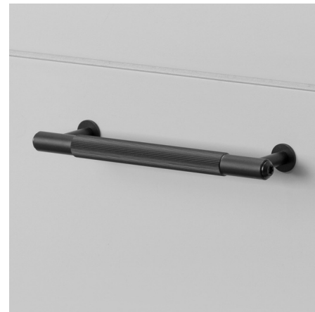
Shown in black

The Linear Pull Bar is refined by hand and features Buster + Punch's signature diamond-cut, linear knurl pattern. Black: Made from Aluminum and then anodized to give a deep Black finish. Brass: Made from precision-machined solid brass and finished with two layers of durable satin lacquer. This finish will age slowly, moving from radiant brass to deeper and golden within a few years. Steel: Made from solid stainless steel and refined by hand. Steel is Buster + Punch's most durable finish and will remain the same for years to come.