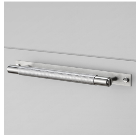
Shown in steel

Buster + Punch's Pull Bar is refined by hand and features their signature diamond-cut, cross-knurl pattern. It is paired with a Solid Metal backplate and matching screws. Black: Made from Aluminum and then anodized to give a deep Black finish. Brass: Made from precision-machined solid brass and finished with two layers of durable satin lacquer. This finish will age slowly, moving from radiant brass to deeper and golden within a few years. Smoked Bronze: This is a living finish, meaning the more it is used the more the base Brass will show through. It will age with you. Steel: Made from solid stainless steel and refined by hand. Steel is Buster + Punch's most durable finish and will remain the same for years to come.